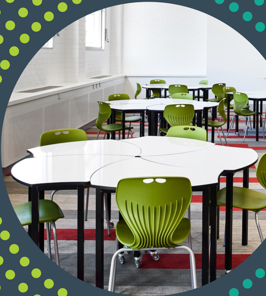
Table manufacturing process